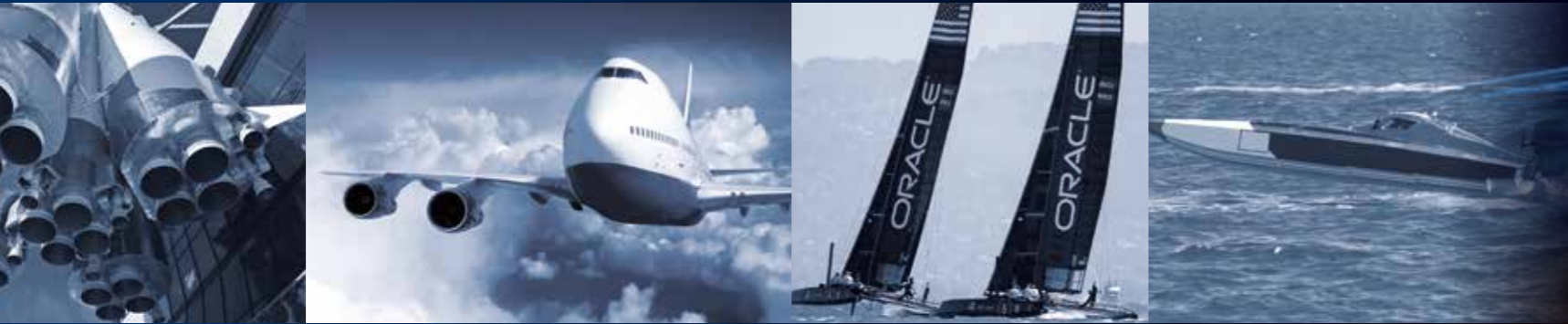
aerospace | F1 & motor sport | automotive | marine industry