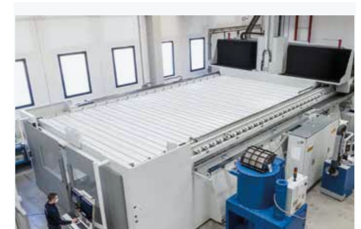
Bellows-type roof for dust and aluminium chips control