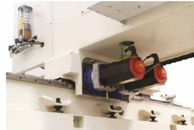
Kinematics with two drive motors on linear axes: backlash recovery, higher rigidity