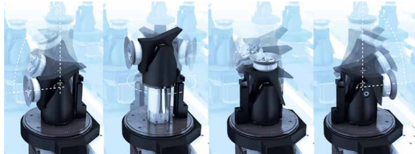
5X ACTUATOR WITH CN-CONTROLLED ORIENTATION IN THE SPACE (0-90° / 360°)