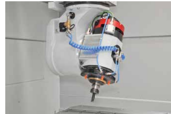
5 axes milling unit with direct drive technology